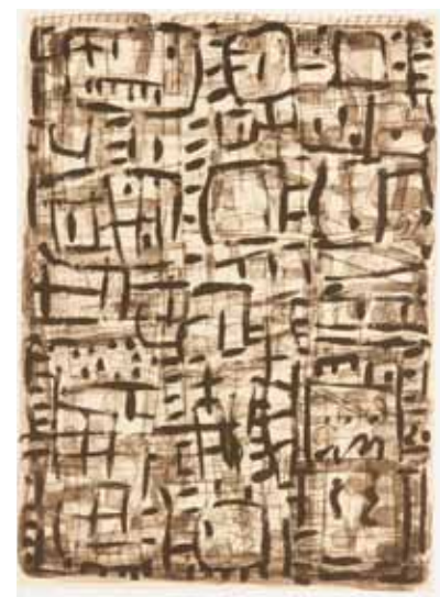
Top: Neridah Stockley, N'Dhala Gorge II 2009, drypoint etching, edn 1/1 3rd State, 20 x 14.5cm [image], gifted by the artist, 2009; CDU Art Collection – CDU1818