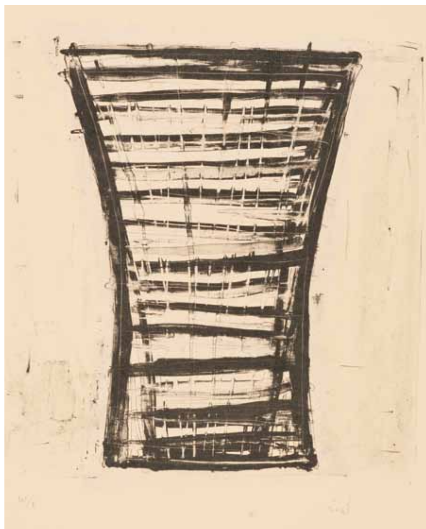
Above: Pinaree Sanpitak, Womanly Body 1999, lithograph & chine collé, WP edn 15, 41 x 38.5cm [image], gifted by the artist & Northern Editions Printmaking Workshop, 1999; CDU Art Collection – NTU773