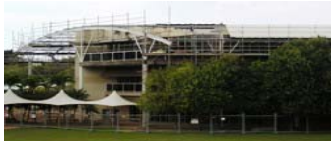
Rust rectification, Level 3, Casuarina Campus

QULOC E-Books (Snr Library Resources Officer) Law librarianship: legal research (Law librarian) Libraries Australia Roadshow, Searching, Document Delivery (Document Delivery team) Horizon Circulation, Reserve Bookroom (RIS Coordinator) New Supervisors (Library Resources Officer)