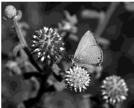
The Two-spotted Line-blue Nacaduba biocellata at the flowers of Apple Bush ( Pterocaulon sp.) in Lawn Hill National Park. (Don Franklin)