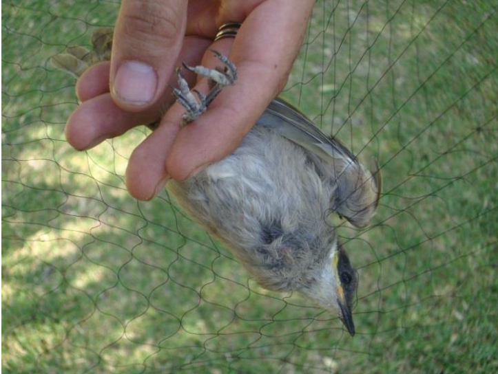
Figure 3 A singing honeyeater being removed from a mist net. Note the feet being extracted first with netting only remaining around the carpal joint.