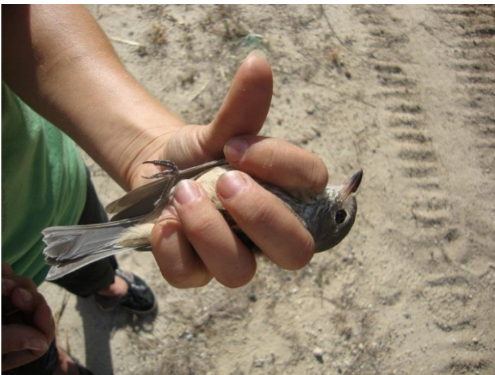
Figure 5 A rufous whistler in the 'banders grip'.