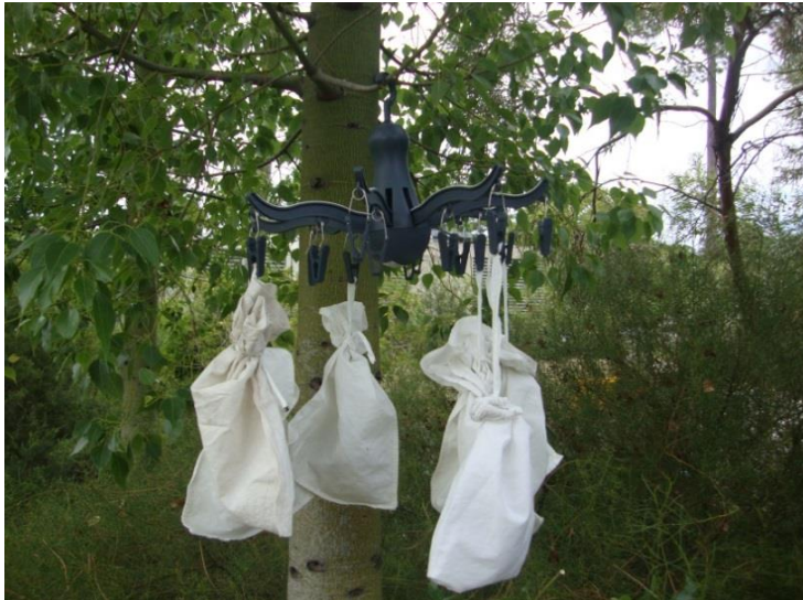
Figure 6 A 'clothes line' set-up.