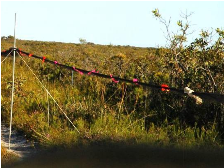
Figure 2 A furlled mist net.

Mist nets are usually stored in cloth bags with the string loops of each end bunched and tied together and one bunch at the bag's opening. When nets are not in use they are removed or furlled (by rolling and tying off with flagging tape at one metre intervals) so that they will not continue to entangle birds or other animals, or unfurl in the wind (see Figure 2). Training in correct, tight furling techniques by an ABBBS license holder is recommended. Even small sections of loosely-furlled net can entangle flying birds. All loose sections must be attended to.