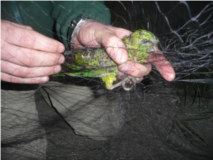
Figure 4 A western ground parrot being removed from a mist net.