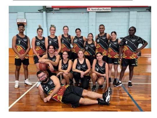
CDU's Indigenous Nationals Team, Dangunbila (Kangaroo in Larrakia Language)

IHD residents enjoying a cycle to Casuarina Coastal Reserve.