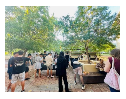
Students enjoying the free at Revive 2 Survive during stuvac.