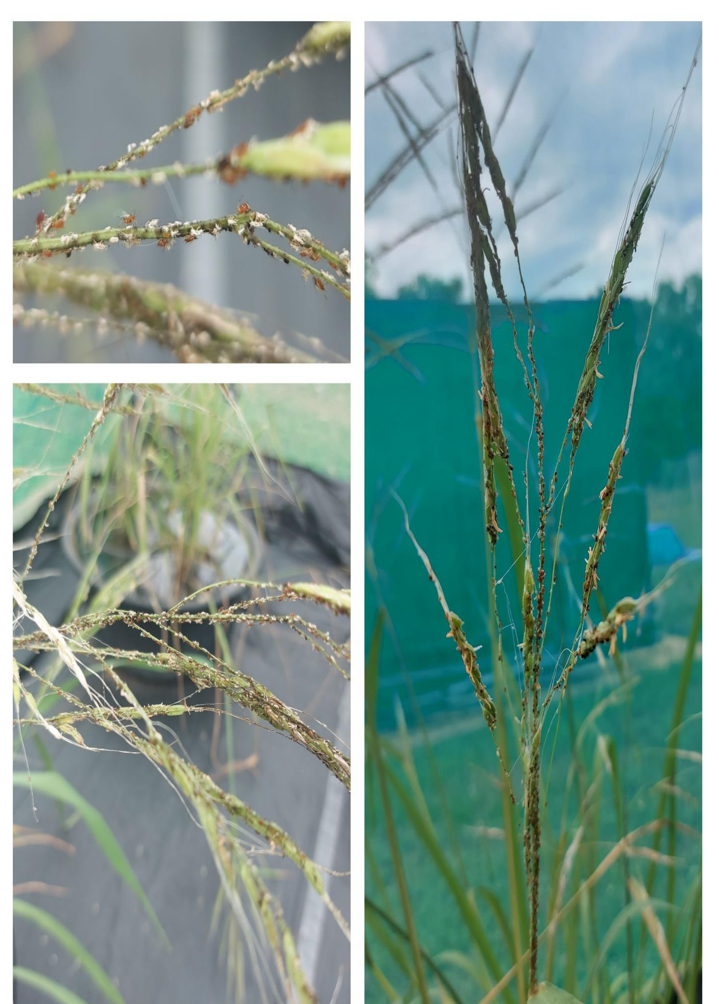
Aphids being controlled by the lady beetle larva and adults on Australian native rice plants.