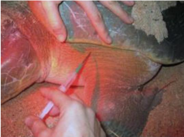
Figure 4 Inserting the PIT tag. Steady yourself and insert the needle in a smooth and confident motion, angling it away from the head. Do not move the needle inside the body. Remove it immediately after depressing the plunger maintaining the same angle at all times.

ANIMAL WELFARE: The needle should be inserted and withdrawn at a horizontal angle away from the head and neck area. Do not move the needle inside the turtle as this can cause internal laceration and bleeding.