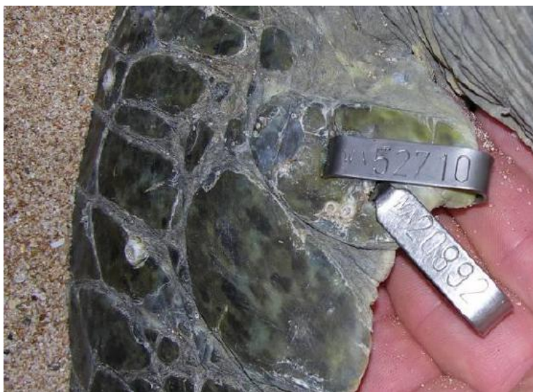
Figure 5 Green turtle flipper showing a new tag inserted in the centre scale, because the old tag is growing out with the scale.