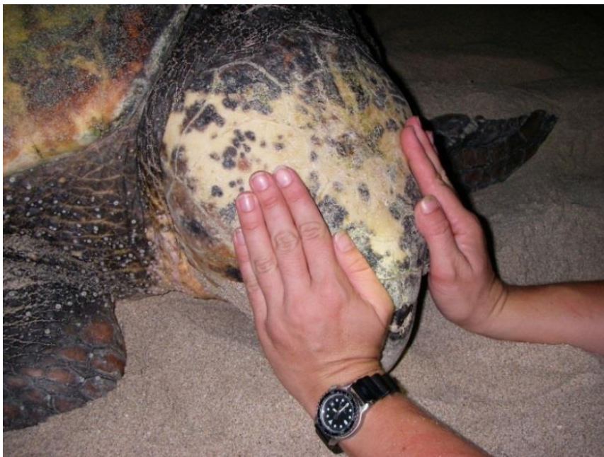
Figure 2 An example of restraining a loggerhead turtle. Note that the turtle is being restrained from the front, the nostrils are clear, and the handler's fingers are pointing up and away from the turtle's mouth.

If restraint is necessary, do so as instructed by the team leader since the method can vary depending on the circumstances. Restrain the turtle by covering its eyes, making sure that its nostrils are exposed, so that it can breathe, and to minimise discomfort. Restrain by facing the turtle, pushing the head back into the carapace and downward, applying only enough pressure to stop the forward movement of the turtle. Fingers must be kept pointing upward, away from the turtle's mouth (see Figure 2), as they can be bitten (or even severed) by the turtle.