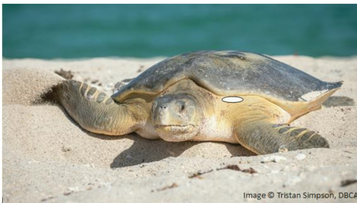
Figure 3 PIT tag application site in the left shoulder (white circle).