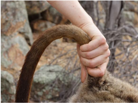
Figure 2: A black-flanked rock-wallaby grasped by the base of the tail