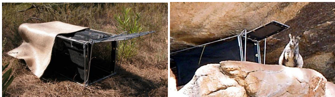
Figure 1: A Thomas trap set up with a hessian sack as shade (left) and a Thomas trap with a black-flanked rock-wallaby at Querekin Rock.

the shade cloth) and is hooked to the rear of the trap by shock-cord loops (see Figure 1). The door is released via a treadle plate mechanism similar to that of a cage trap. The door consists of shade cloth attached to a steel rod frame by cable ties. This trap was designed by Neil Thomas (Science Division, Woodvale), with assistance from Sheffield Wire Products (Sheffield Rd, Welshpool WA), specifically for use with small to medium-sized macropods. It is manufactured commercially by Sheffield Wire Products. Two sizes have been manufactured: a 30 cm high frame for hare-wallabies and 45 cm high frame for tammar wallabies and rock-wallabies.