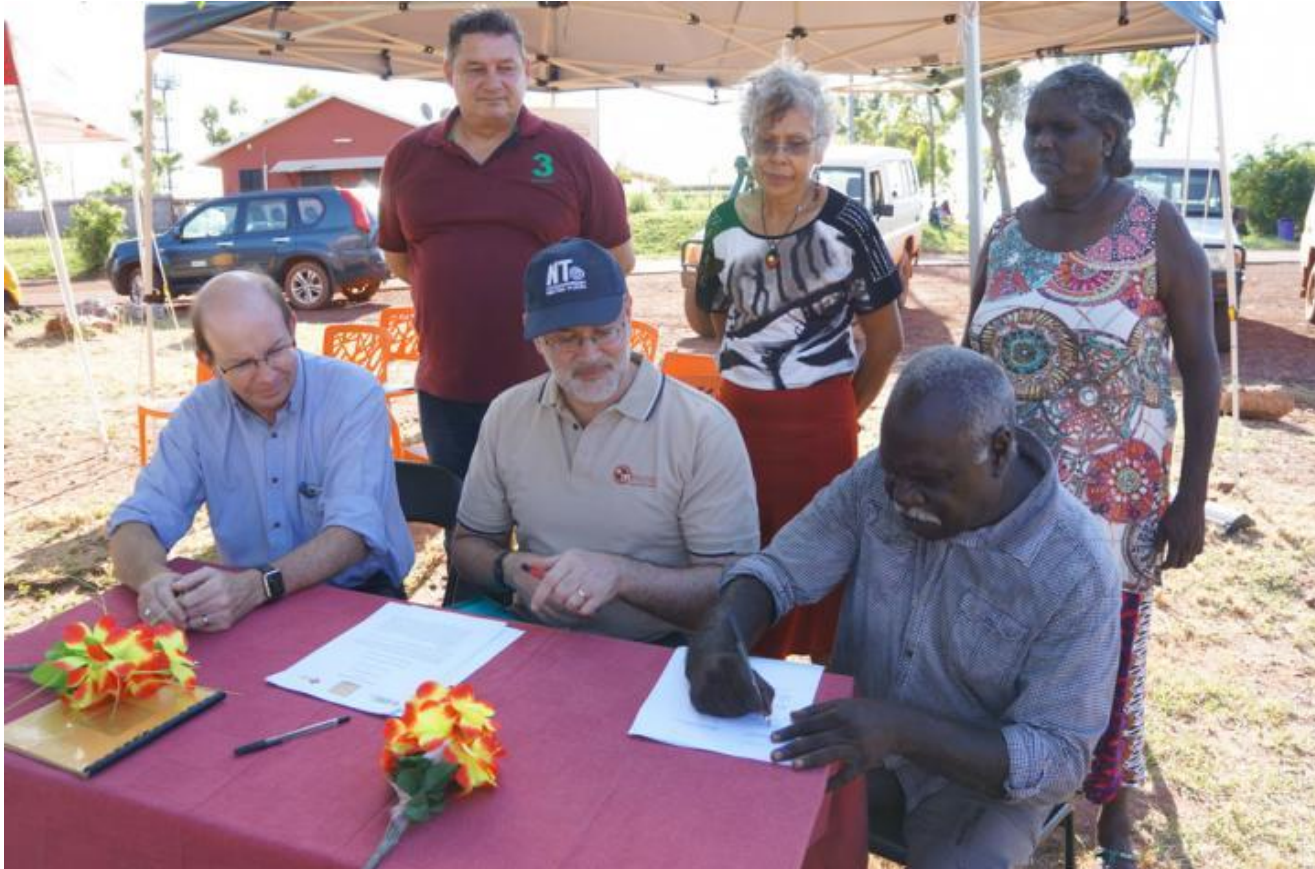
Signing an MOU between CDU, Yalu' and Menzies, 2016