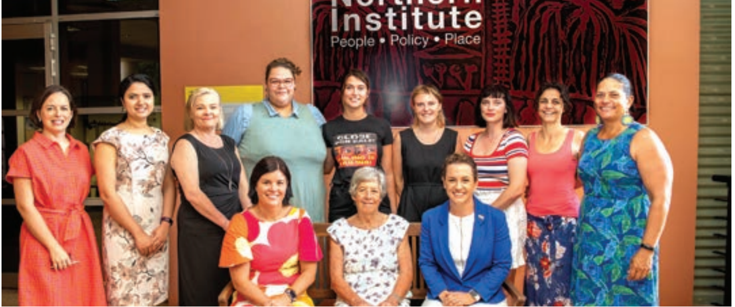
Front row: The Hon. Natasha Fyles MLA - Chief Minister of the Northern Territory, The Hon. Sally Thomas AC - Former Administrator of the Northern Territory, Lia Finocchiaro MLA - Leader of the Opposition with 2022 cohort.