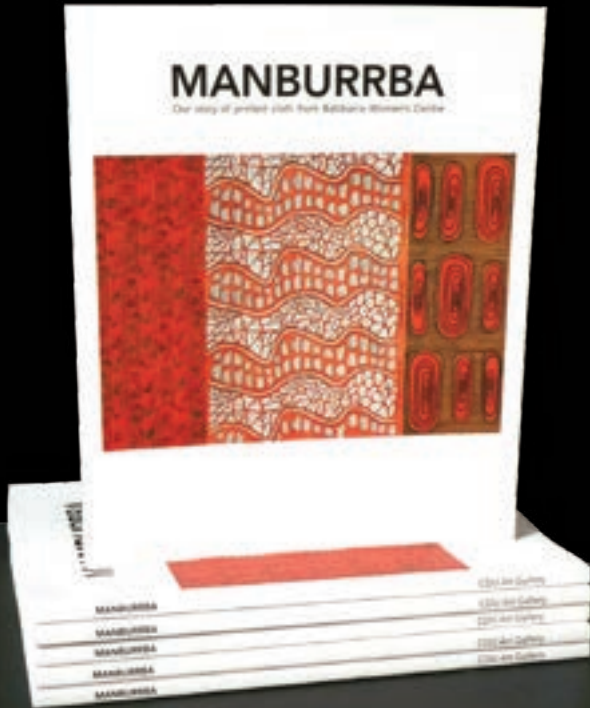
Cover of the exhibition catalogue, Manburrba: our story of printed cloth from Bábbarra Women's Centre , published by the CDU Art Gallery in 2023.