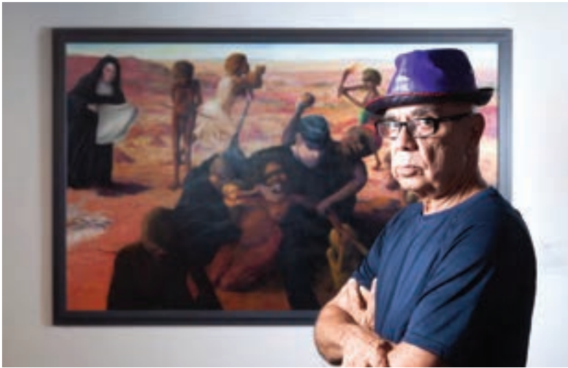
Harold Thomas standing in front of his award-winning painting 'Tribal Abduction'.